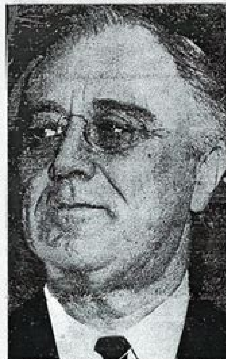
President of the United States and Commander in Chief of all United States Armed Forces, Franklin Delano Roosevelt last month began his tenth year in the White House since he took office in 1933. Roosevelt's ability to remain calm in the face of great trials, said the president's physician, "nine years in the White House have left most men."