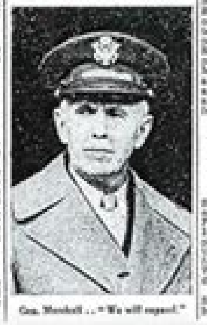
Gen. Marshall... "We will report."

PITTSBURGH, PENN. (AP)—"We will stay on the job until the war is won." This is the pledge given by the Congress of Industrial Organizations and the American Federation of Labor, Philip Murray, president of the C.I.O., and William Green, president of the A.F. of L., addressed together for the first time here recently to give the joint pledge. Negative Cost Up NEW YORK, N.Y. (AP)—The "negative" meaning plus and minus signs have raised their price from 1 to 12 cents.